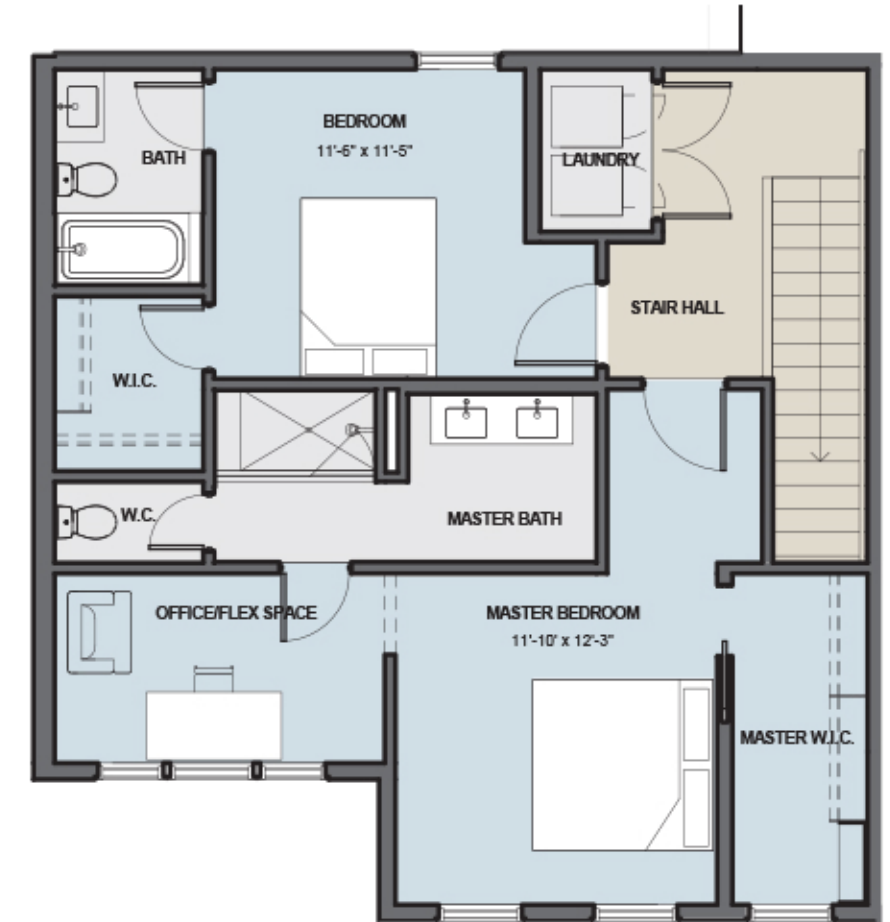
UNIT 10 - SECOND FLOOR PLAN