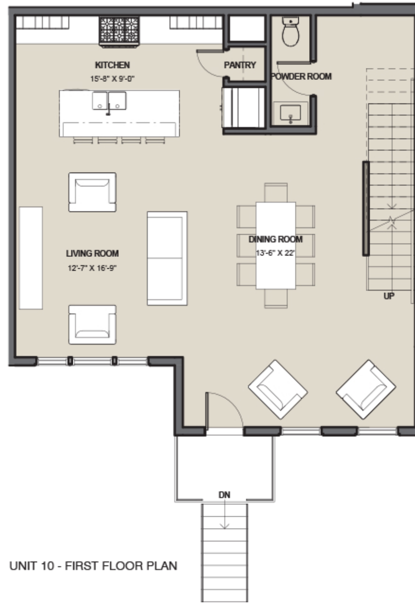
UNIT 10 - FIRST FLOOR PLAN