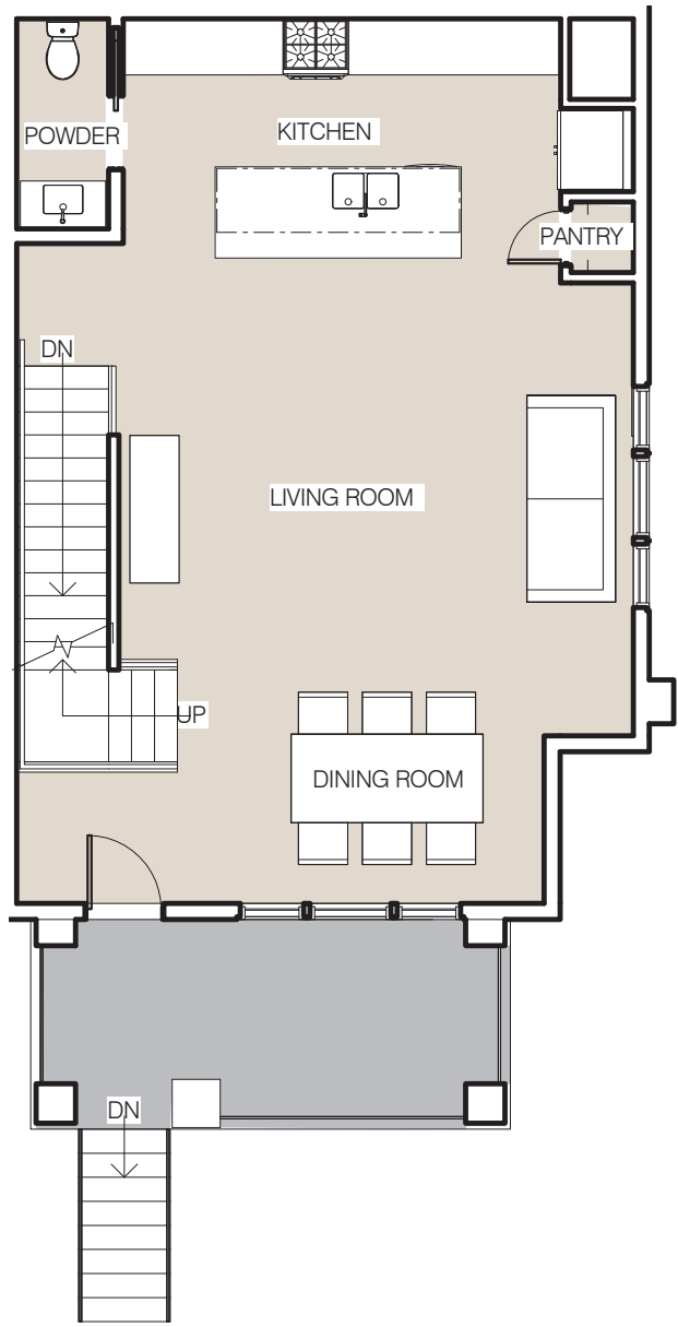
2 FIRST FLOOR PLAN SCALE: 1/8" = 1'-0"