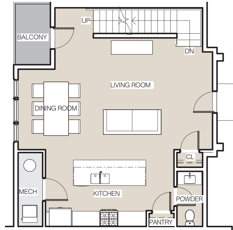
2 FIRST FLOOR PLAN SCALE: 1/8" = 1'-0"